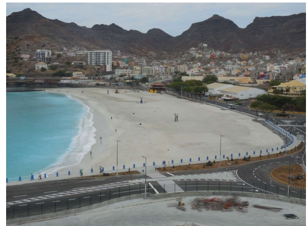
Laginha Beach after completion of sand filling

The increase of the beach to its final dimensions involved the use of 170,000m 3 of sand that was dredged and pumped ashore.